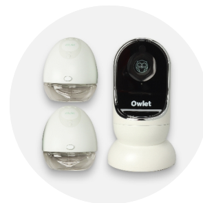
Baby & Mom