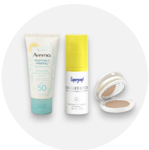
Acne & Skincare